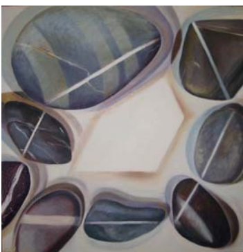
“The Wolf Blows My Own Stone Home” (Oil on Canvas)

When I first started painting I was working as a scientific illustrator. I drew and painted images for chil-